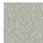
Light grey steel