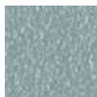
Light blue metal