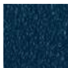
Ocean blue steel